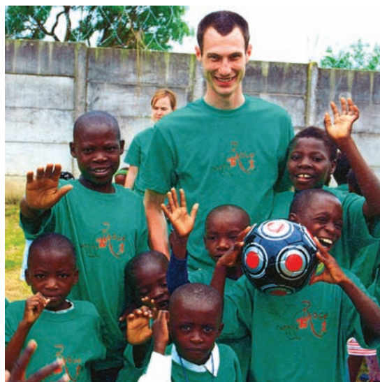
Lifesong students wave "thanks" to Cunningham youth.

Different countries. Different challenges. But the same God provides healing around the world.