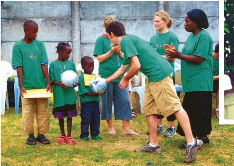
Lifesong students receive the soccer balls donated by Cunningham kids.

Not long after, the youth at Cunningham received pictures of the Lifesong youth playing soccer together. They also received photos, drawings, and letters from students in the Lifesong School.