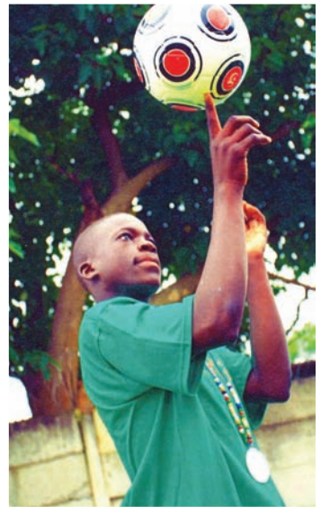
Showing off some skills.